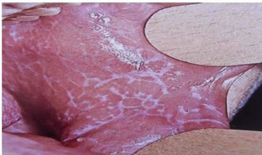
Figure 1: Reticular form of oral lichen planus [4]

This type shows whitish homogeneous irregularities similar to leukoplakia; it mainly involves the dorsum of the tongue and the mucosa of the cheek (Figure 4). OLP lesions which are associated with patchy brown melanin deposits in the oral mucosa are termed as inflammatory melanosis [12].