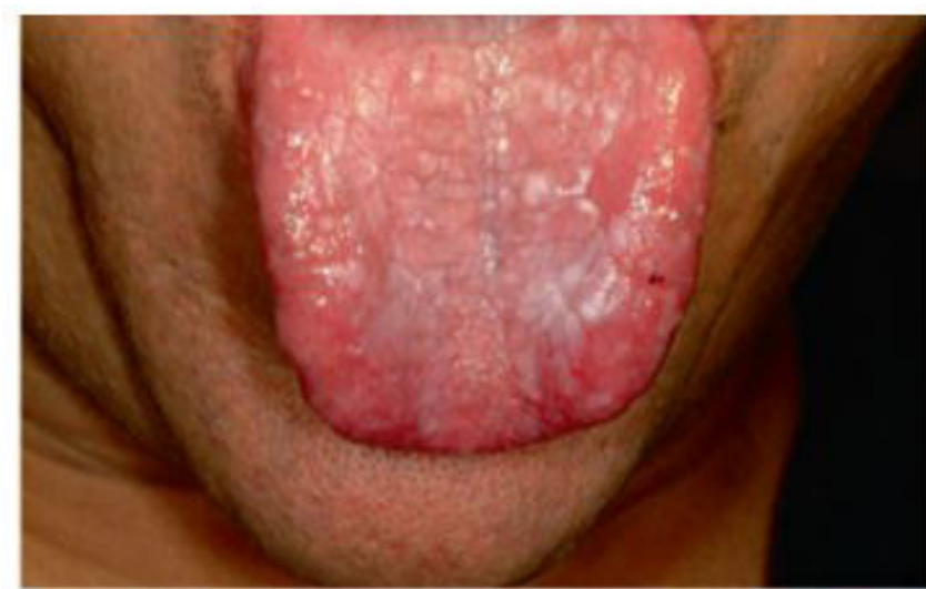
Figure 4: Atrophic and plaque-like OLP [4]