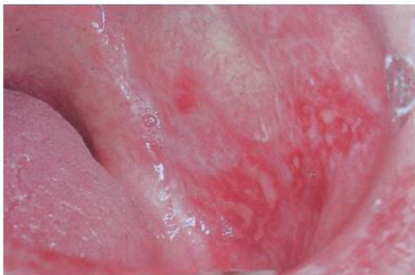
Figure 2: Erosive form of oral lichen planus [4]