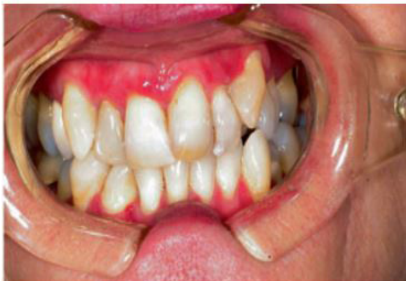
Figure 3: Desquamative gingivitis OLP [4]